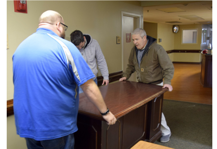
Move in Day for the Foster Care Case Managers