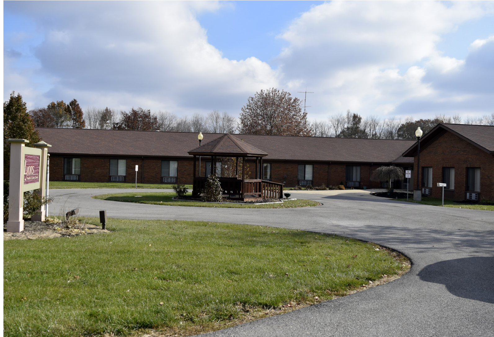
The new building is for the “least of these” and whatever we do for the “least of these” we do for Him. (Matthew 25:40)